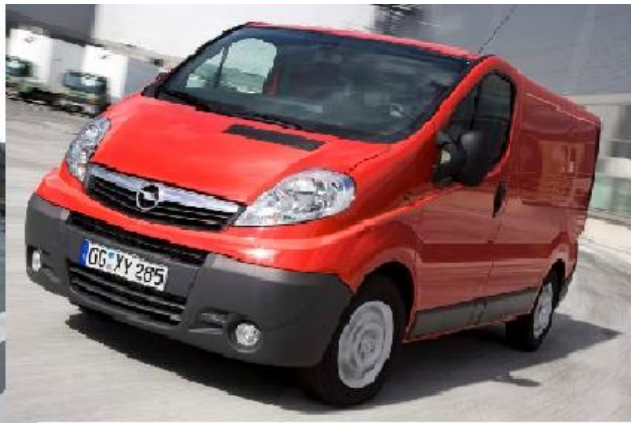
New Vivaro Van