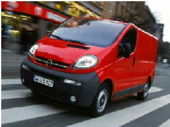
Previous Model Vivaro Van

The Opel Vivaro is already one of the most popular vehicles in its segment due to an excellent mix of space, engine performance, economy and specification level. It is difficult to improve a product that is already well accepted, however, from MY07.5, the Vivaro now features a stylishly designed new front-end. Through the addition of a new front bumper, front grille and re-designed front headlights, the Vivaro benefits from a more modern look and one that emphasizes the Opel design language